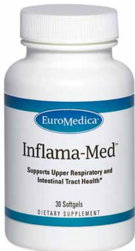
#76003 30 Softgels