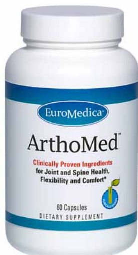
#70196 60 Capsules